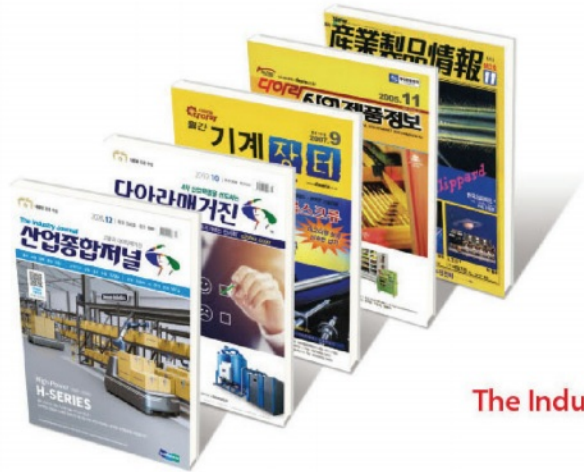
The Industry Journal